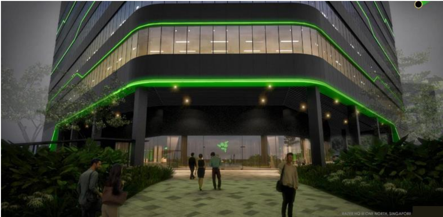
RAZER HQ @ ONE NORTH, SINGAPORE